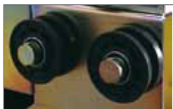
Ball bearing wheels

* Duty Cycles depend on gate size and installation