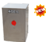
12710651 Case in stainless steel