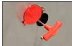
User friendly manual release with key